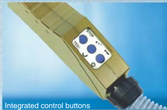
Integrated control buttons