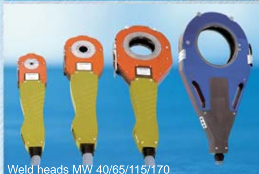
Weld heads MW 40/65/115/170